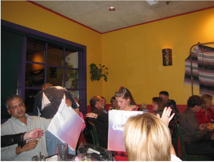
The well choreographed prize giveaway got started with help from the younger members of our group.